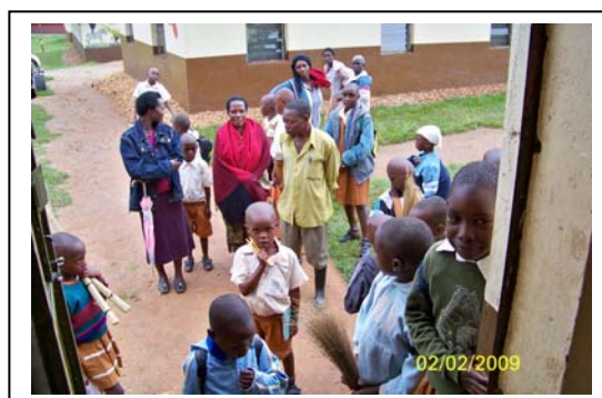
PARENTS AND THEIR CHILDREN DESIRING TO REGISTER