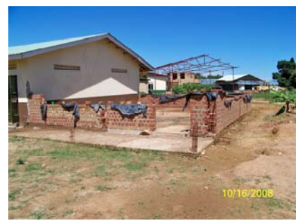
◀ DSCA’s new swings made from “treated” poles resistant to termites

Shiloah Ministries Incorporated – 100% of donations are applied as specified