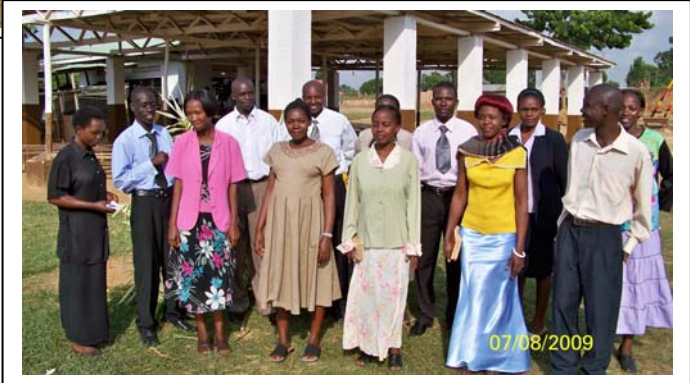
▲ Prayer at chapel time Our teaching staff ▶